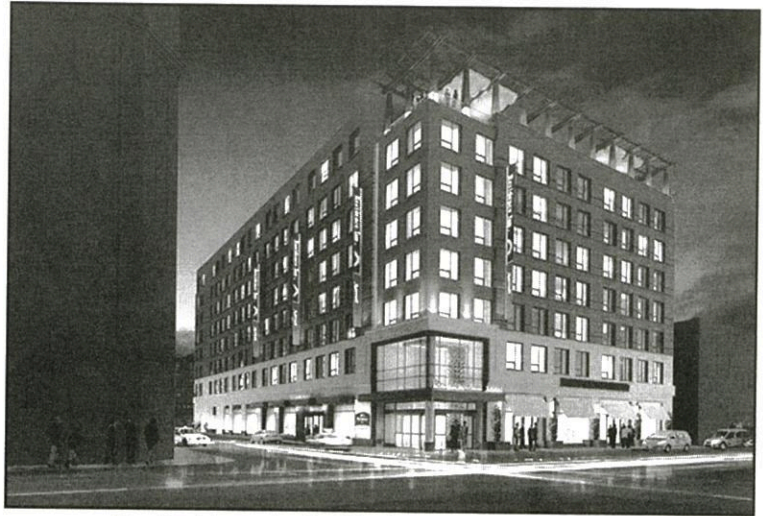
The Residence Inn by Marriott Fenway - Boston, MA